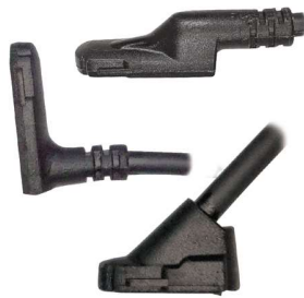
9704 / 9705