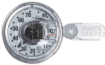
Gen 4 Dial

Features: Analog/Digital Outputs, Weatherproof, Snap-fit