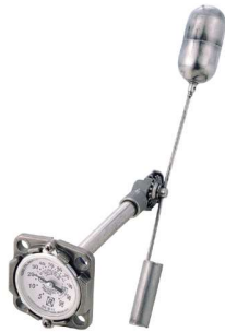
A6200 / A6400